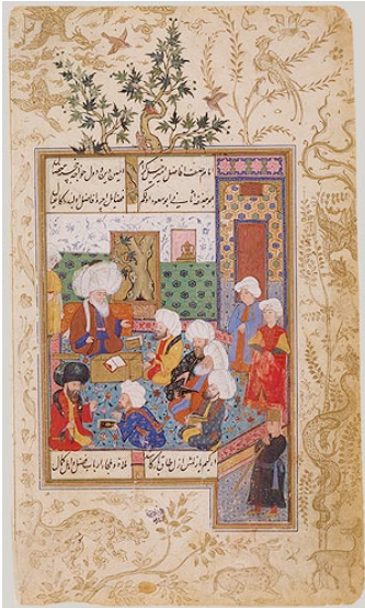
"Shaikh al-Islam Discoursing to an Audience: Page from a dispersed Divan of Mahmud 'Abd al-Baki, 1590-95, Ottoman [Iraq (Baghdad)] (25.83.9)". In Heilbrunn Timeline of Art History . New York: The Metropolitan Museum of Art, 2000-. Ink, colors, and gold on paper, H. 10 1/4 in. (26 cm), W. 6 in. (15.2 cm)

http://www.metmuseum.org/toah/works-of-art/25.83.9