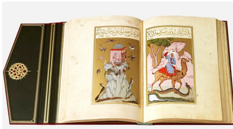
The Book of Felicity, Sultan Murad, Ottoman Empire, Gaspard Monge, original manuscript in the Bibliothèque Nationale (Paris), published as a facsimile edition by M. Moleiro, 2007 (ISBN849640031X, 9788496400313), 445 pages.

http://www.metmuseum.org/toah/works-of-art/25.83.9