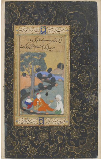
Young prince and attendant , early 17th century, Ottoman period, Ink and gold on paper, H: 21.0 W: 12.5 cm, Turkey Purchase F1962.32

Freer and Sackler Gallery, Smithsonian Institution, Washington, D.C.