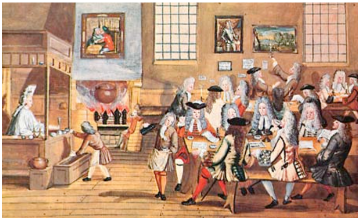
A London Coffeehouse in the time of Charles II, ca. 1660 at http://www.lordprice.co.uk/DRNA1010.html

http://www.asia.si.edu/collections/singleObject.cfm?ObjectNumber=F1908.283