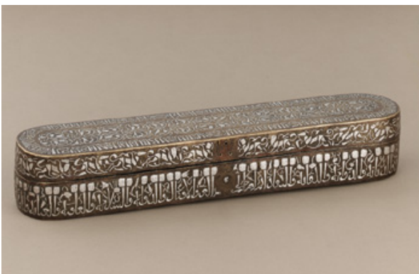
Pen box , 13th century (1210-11), Shazi, Brass inlaid with copper, silver and black organic material, H: 5.0 W: 31.4 D: 6.4 cm, Iran,

Freer and Sackler Gallery, Smithsonian Institution, Washington, D.C., Purchase F1936.7