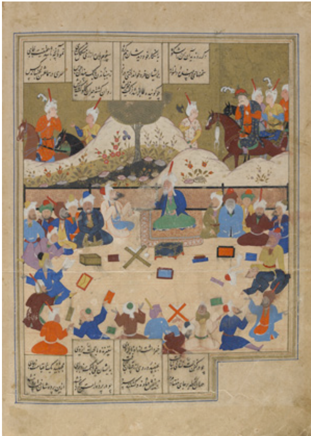
Detail from a Folio from a Khamsa (Quintet) by Nizami; verso: Alexander approaches Plato; recto: text, 1548, Safavid period Ink, opaque watercolor and gold on paper, H: 31.1 W: 19.7 cm Shiraz, Iran F1908.283

http://www.asia.si.edu/collections/singleObject.cfm?ObjectNumber=F1908.283