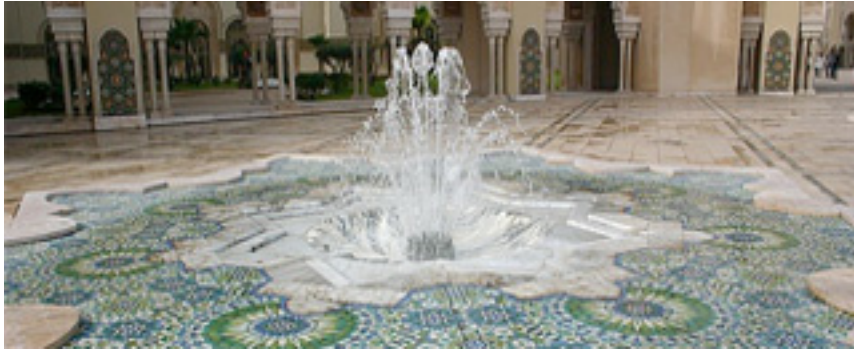
Fountain near the Hassan II mosque in Casablanca, Morocco