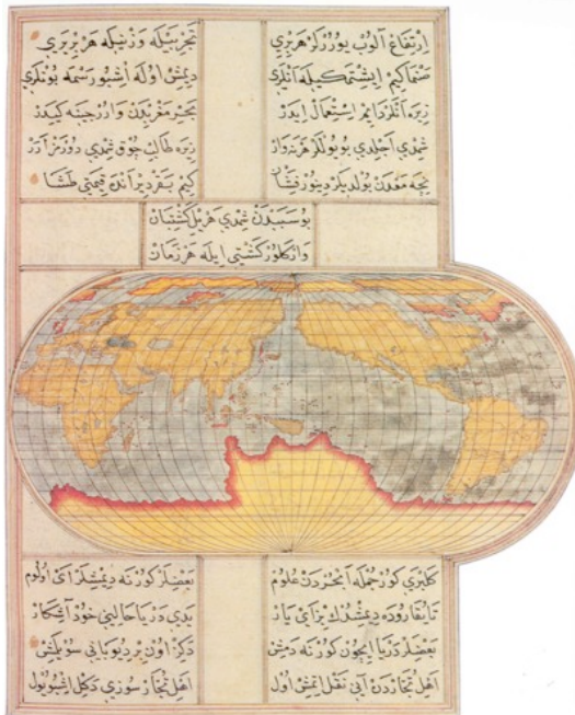
Kitab-i Bahriye, W.658: Book on Navigation , Author: Piri Reis (Turkish, 1465-1555), Date (Period): late 11th century AH/AD 17th century-early 12th century AH/AD 18th century (Ottoman)

Originally composed in 932 AH/AD 1525 and dedicated to Sultan Süleyman I ("The Magnificent"), this great work by Piri Reis (d. 962 AH/AD 1555) on navigation was later revised and expanded. Walters manuscript W.658, made mostly in the late 11th century AH/AD 17 th ,